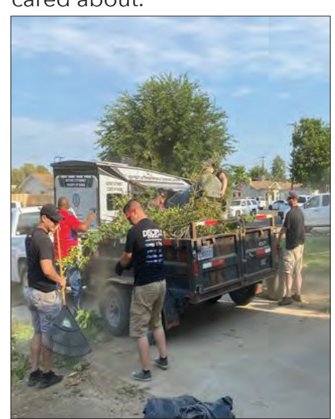
Kings County volunteers work hard for their "Adopt a Senior" program.

removed from the front of her to them. The "elder" could home. It truly was a fire hazard. be a neighbor, grandparent, Our Assistant Chief of Investi- friend or anyone else they