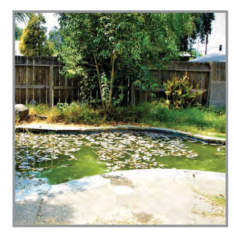
Report neglected pools & hot tubs anonymously

Mosquito-borne diseases can be transmitted to people through the bite of an infected mosquito. Do your part to protect yourself, your family, & your community.