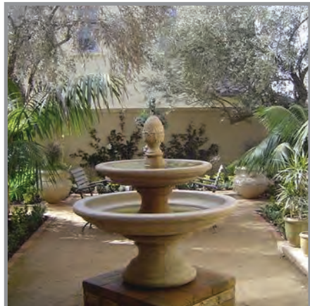
Keep fountains running & chlorinated or empty