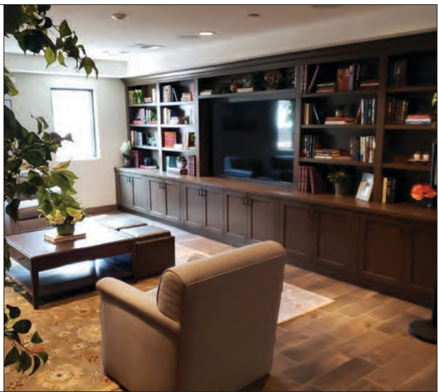
The over-$7 million project improved the 100-apartment, nine-story facility to a higher standard than what people expect from low income residential housing.