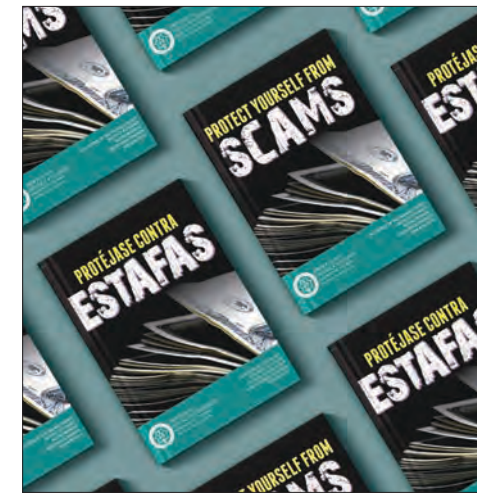
The grant funded books and other educational materials in both English and Spanish.

A significant resource was developed during the 2020 grant cycle - a bilingual book that addresses the most common scams targeting seniors