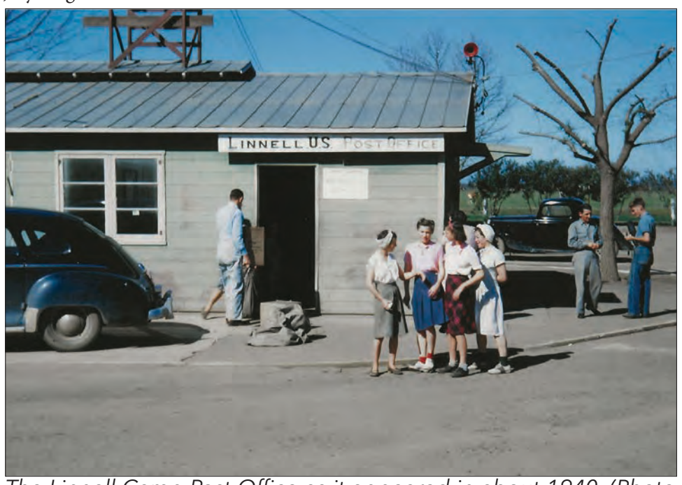
The Linnell Camp Post Office as it appeared in about 1940.