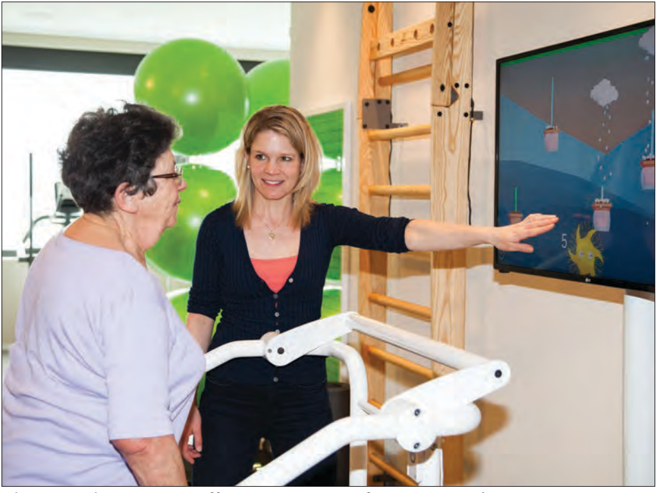
The Dividat Senso offers a variety of games to keep participants challenged and involved.