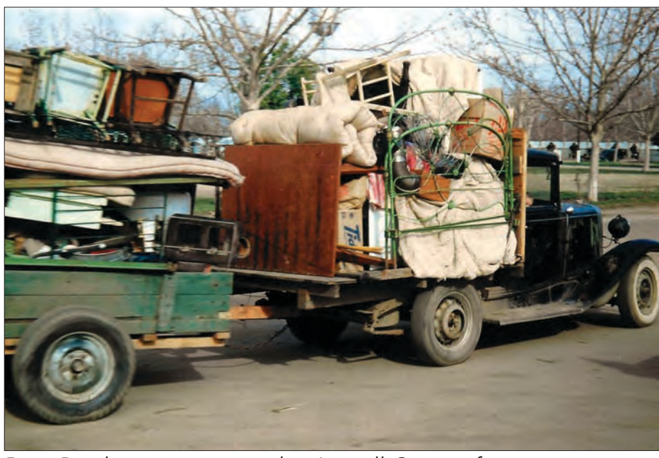
Dust Bowl migrants arrived at Linnell Camp oftentimes carrying all their worldly possessions.