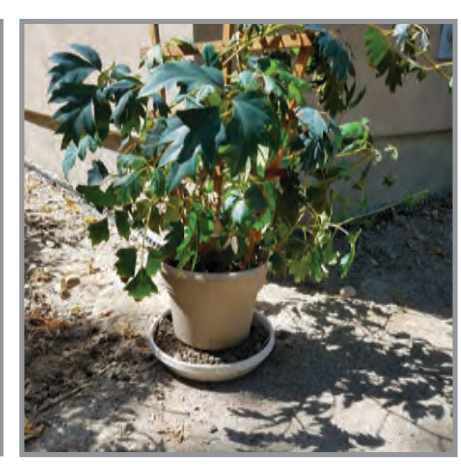
Fill empty plant trays with soil/sand or perlite