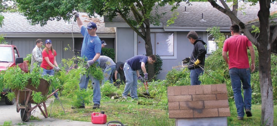
Hands in the Community volunteers perform a variety of services for the elderly and others.

a result are visited by the local fire department.