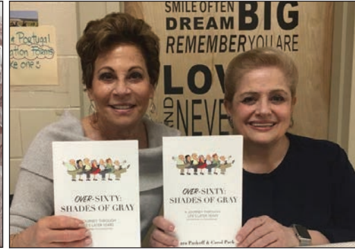
IN THIS ISSUE: Hands in the Community assists seniors, Elder Abuse Task Force receives grant, jackrabbits in Traver, an Over-Sixty workbook