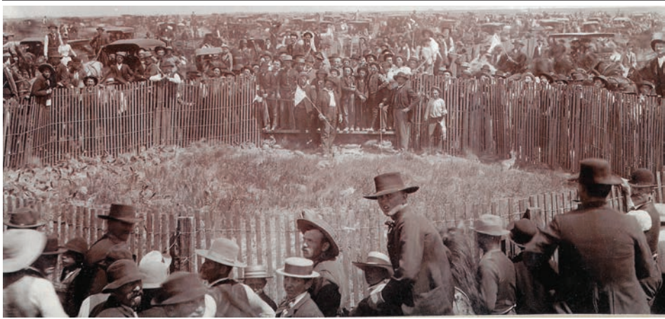
This photo shows a rabbit drive in 1891 somewhere in Tulare County (but not Traver). Notice the size of the crowd.

town to write a story about the festivities.